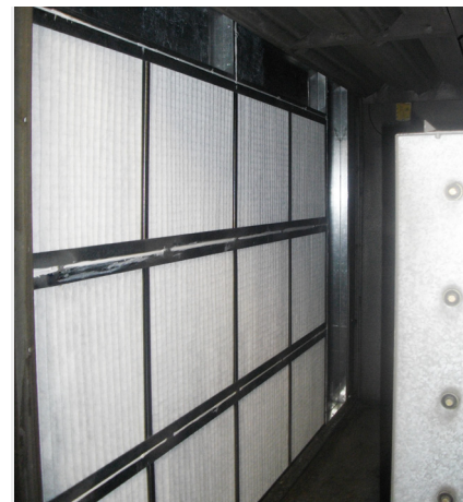
Modification of filter banks