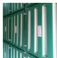
Pictures from the original filter house. Dismantling and erection of the new barrier type Inlet Air System