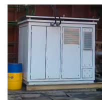
Retrofitted diverter damper system with replaced expansion joints, actuator and HPU.