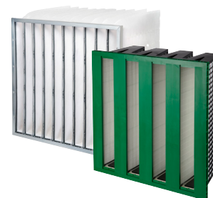
Cam-Flo XMGT M6 Bag filter with non-discharging synthetic media and high dust holding capacity.

and project management was executed in teams across Europe and India. Major fabrication was done at the Camfil Power Systems workshop in Trichy, India.